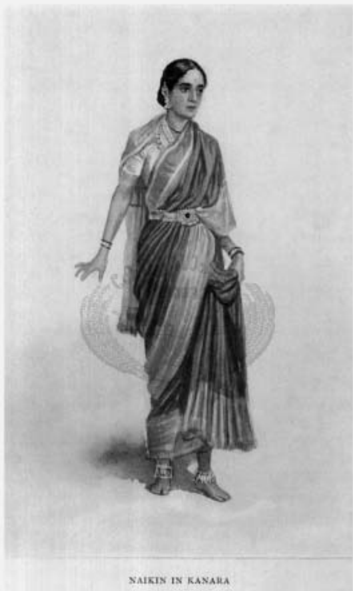
NAIKIN IN KANARA